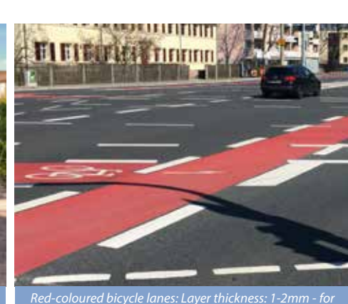
Red-coloured bicycle lanes: Layer thickness: 1-2mm - fo neavy loads: 3mm. PlastiRoute + PREMARK symbols and arro